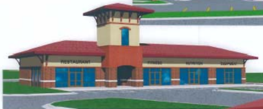
Building 1 - looking North-East