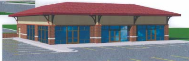
Building 3 - looking North-East