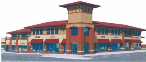
Building 2 - looking North-East