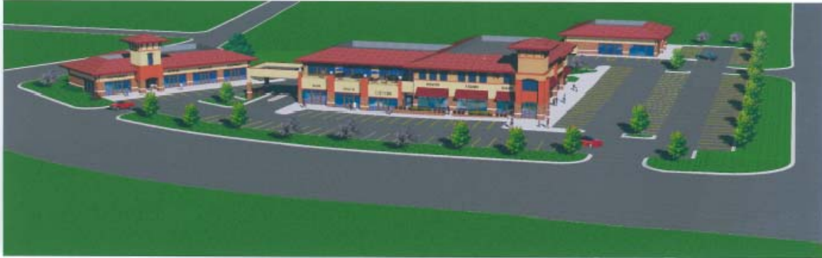
Perspective looking North-East